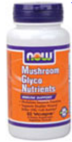
Mushroom Glyco Nutrients

I have counseled parents who expect their toddler to tidy up his room or who demand that their 3 year old child refrain from making a mess when he eats. This is unreasonable and ill informed behavior from adults and will place too much stress on a