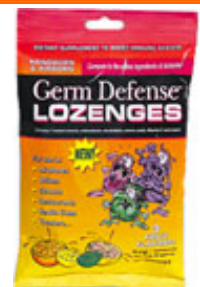
Germ Defense Lozenges

Overall health can often occur naturally if the body receives the proper nu